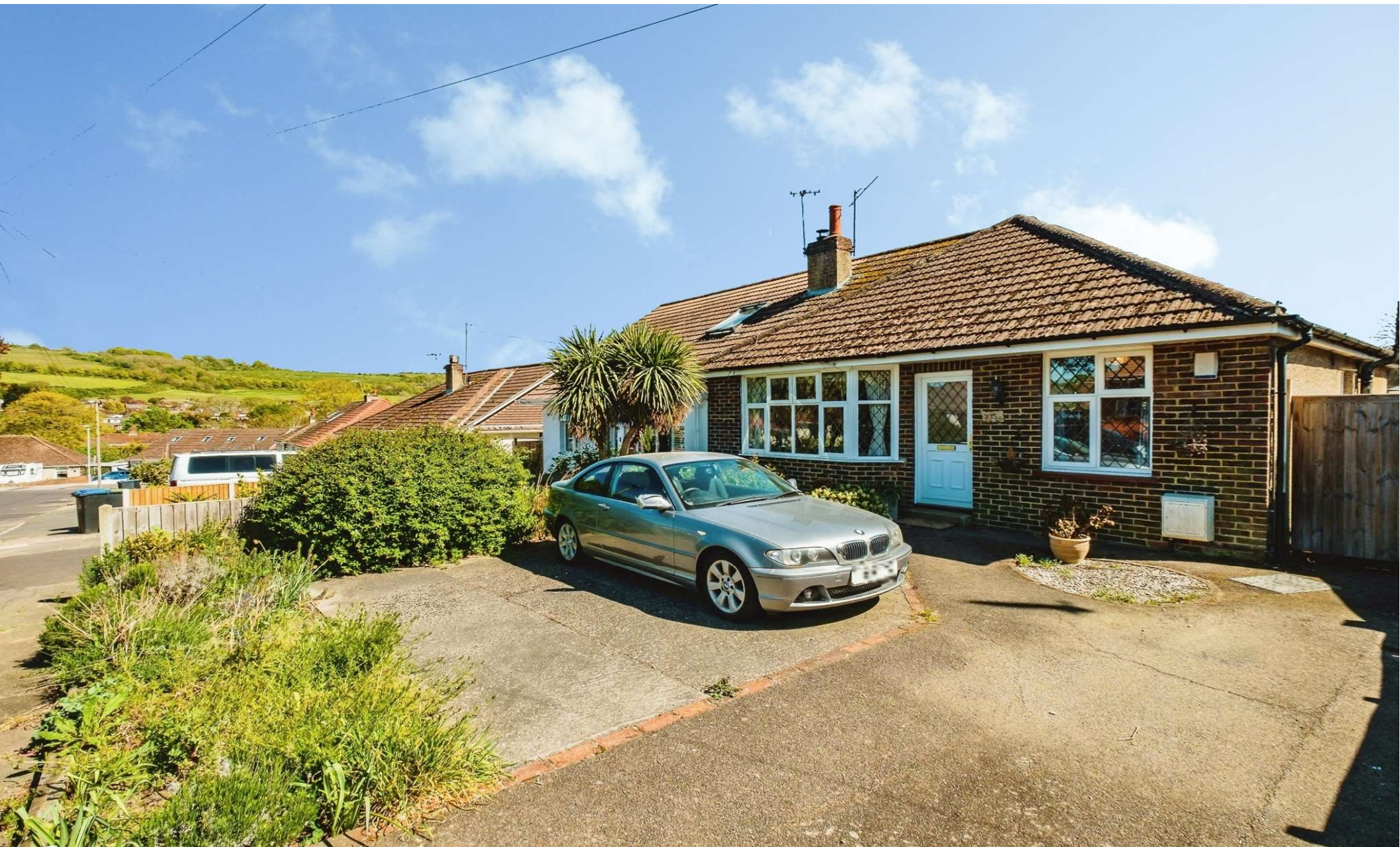
Downside Avenue, WORTHING BN14 0EU