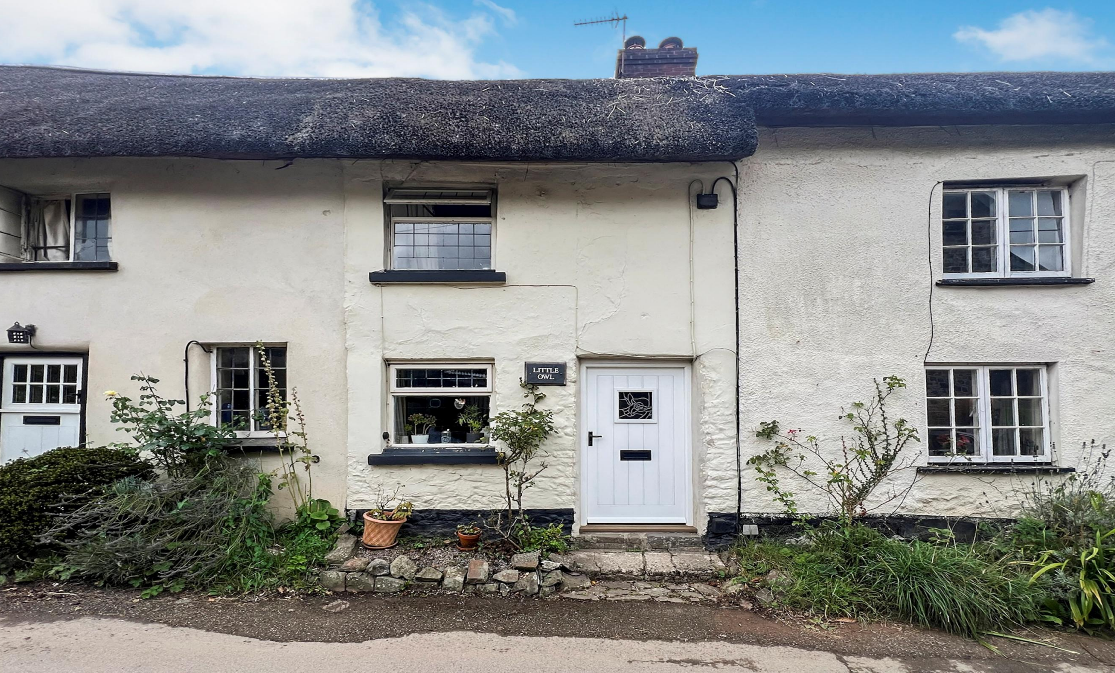
Little Owl Knowstone, Knowstone South Molton EX36 4RY