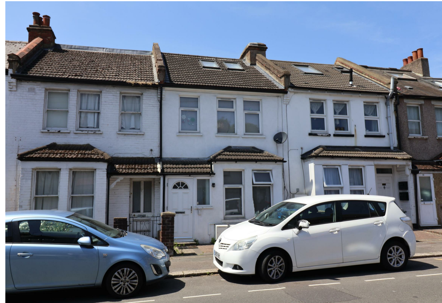
Byron Road, Harrow, HA3 7ST

Whilst every attempt has been made to ensure the accuracy of the floorplan contained here, measurements of doors, windows, rooms and any other items are approximate and no responsibility is taken for any error, omission or mis-statement. This plan is for illustrative purposes only and should be used as such by any prospective purchaser. The services, systems and appliances shown have not been tested and no guarantee as to their operability or efficiency can be given. Made with Metropix ©2025