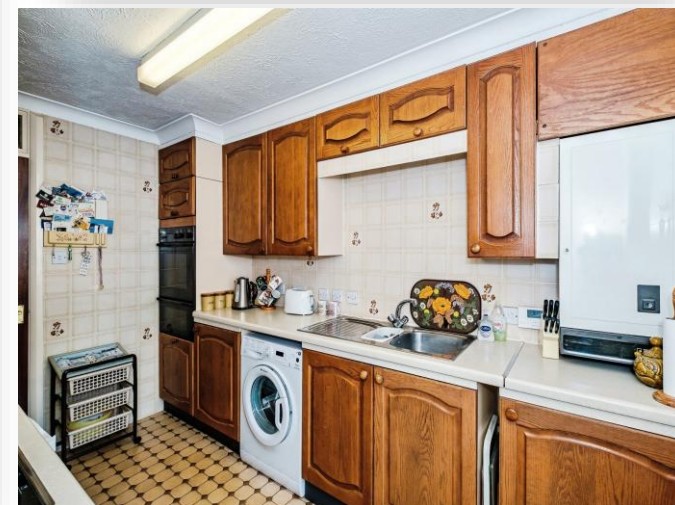
Berkeley Court The Esplanade, Bognor Regis PO21 1LX