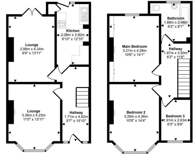
Ground Floor Approx 45 sq m / 487 sq ft

Approx Gross Internal Area 92 sq m / 986 sq ft