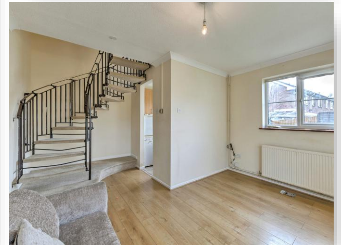
Hedge End, Northampton NN4 0SW