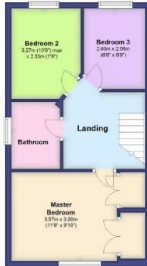
Total area: approx. 85.9 sq. metres (924.7 sq. feet)