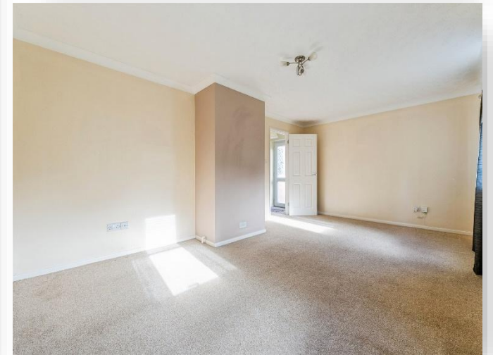
Edmund Road, Brandon, IP27 0XA