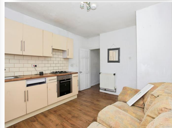
Gladstone Street, Peterborough PE1 2BL