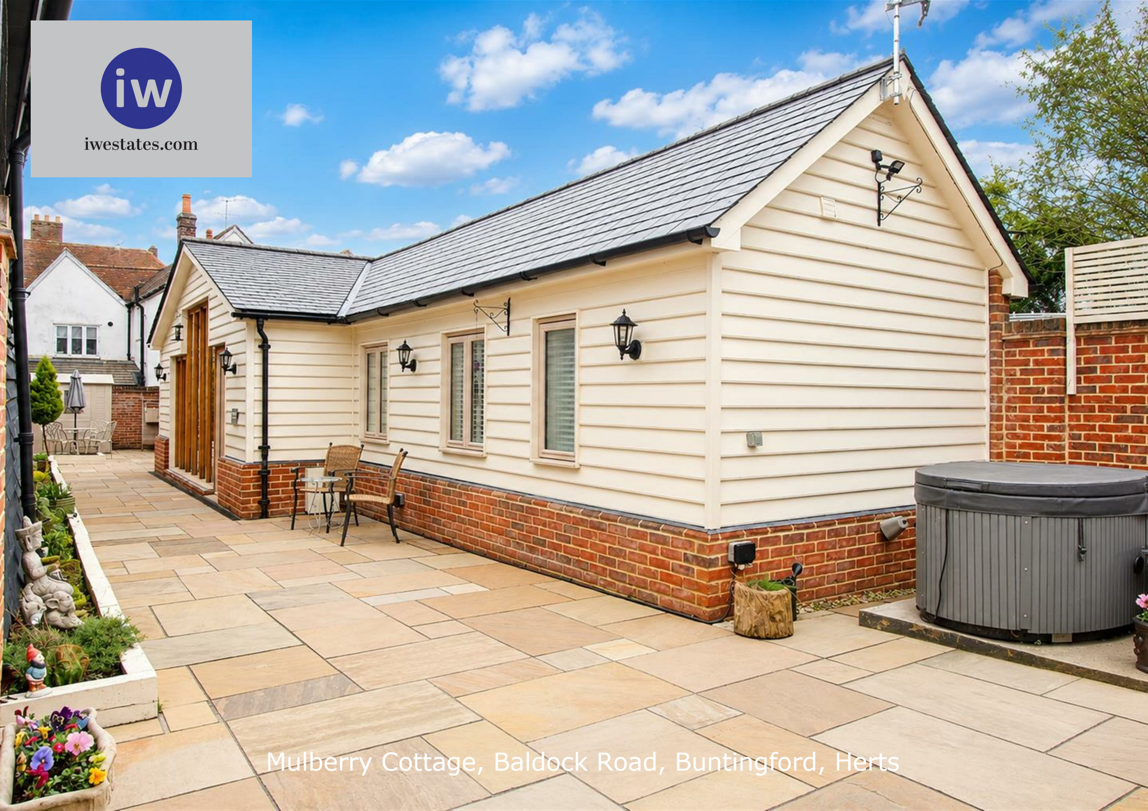
Mulberry Cottage, Baldock Road, Buntingford, Herts