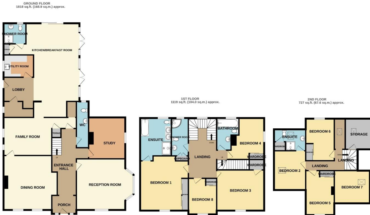
THE VICARAGE, TORKSEY, LN1 2EE TOTAL FLOOR AREA : 3664 sq.ft. (340.4 sq.m.) approx.

Whilst every attempt has been made to ensure the accuracy of the floorplan contained here, measurements of doors, windows, rooms and any other items are approximate and no responsibility is taken for any error, omission or mis-statement. This plan is for illustrative purposes only and should be used as such by any prospective purchaser. The services, systems and appliances shown have not been tested and no guarantee as to their operability or efficiency can be given. Made with Metropix ©2026