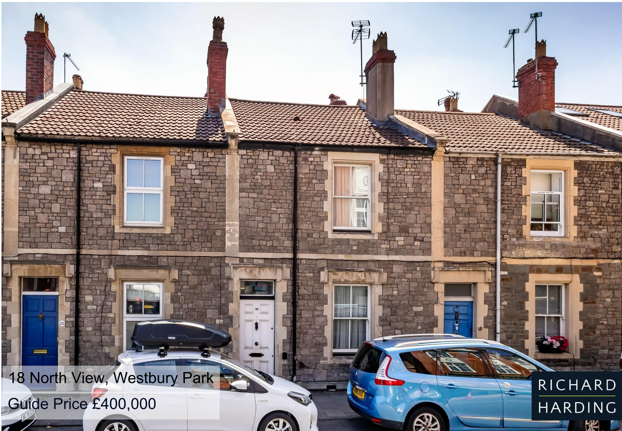
18 North View, Westbury Park Guide Price £400,000