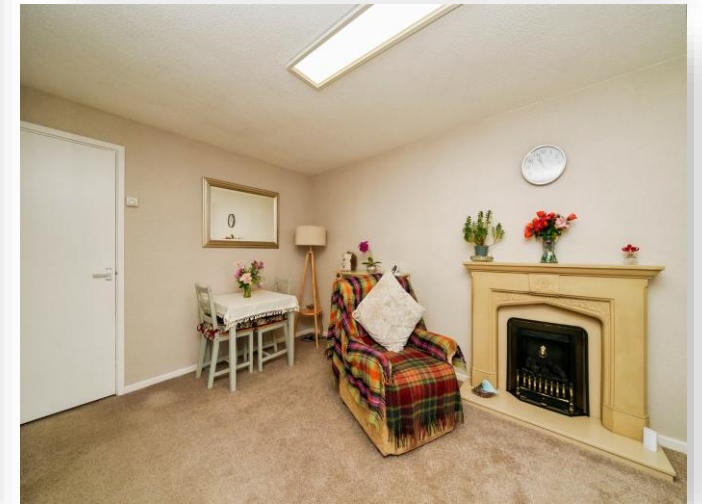
Heathbank Avenue, Wirral CH61 4XD