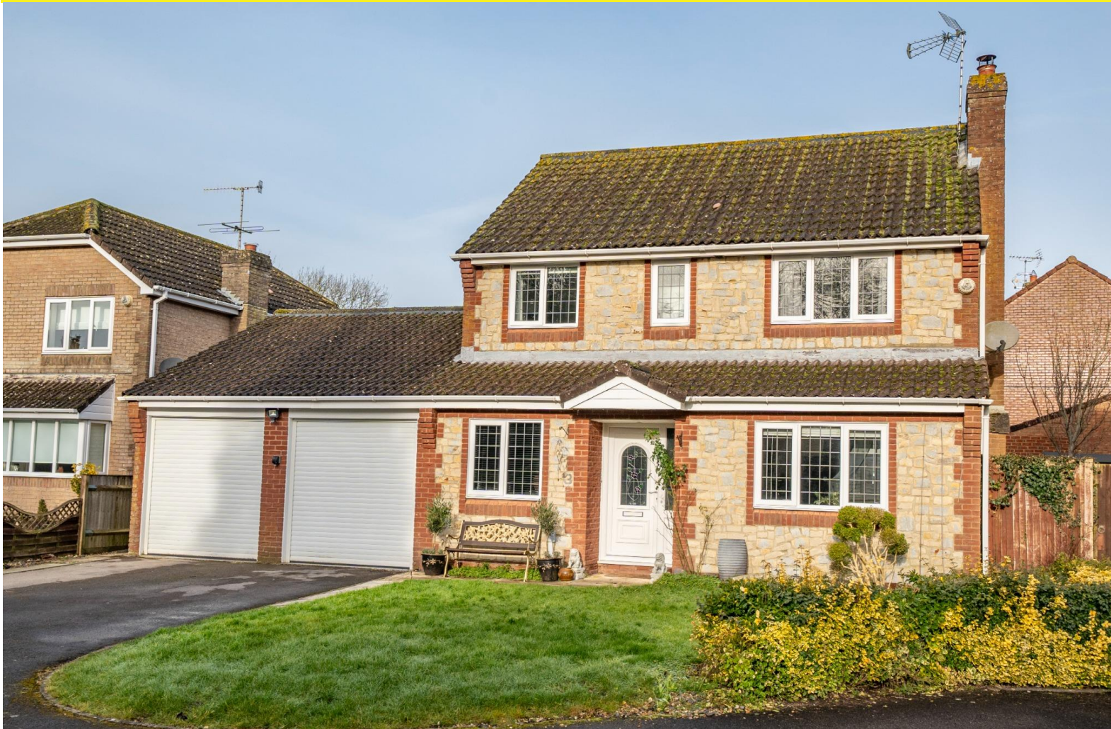
Manor Bridge Court, Tidworth Guide Price £475,000 Freehold