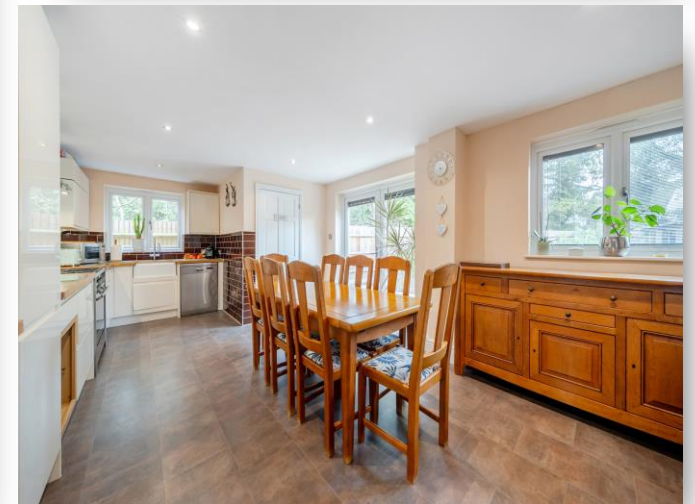
28 Somersby Crescent, Maidenhead SL6 3YY