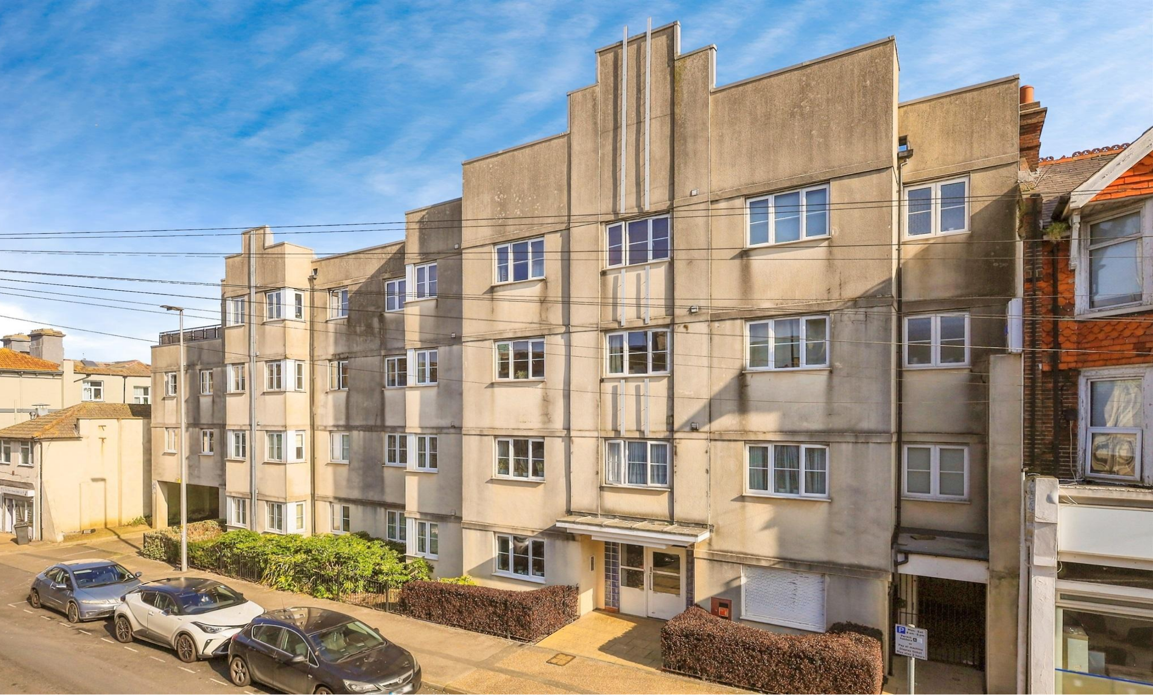
Discovery House Susans Road, Eastbourne BN21 3AG