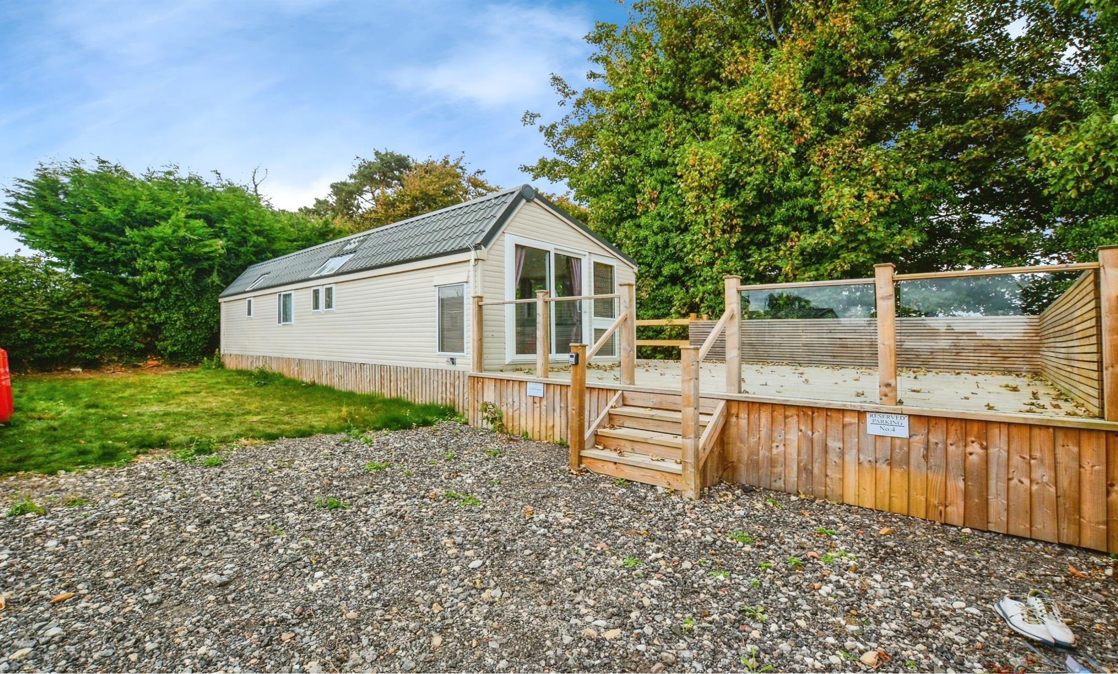
Red Lion Holiday Lets Fen Road,East Kirkby Spilsby PE23 4DB