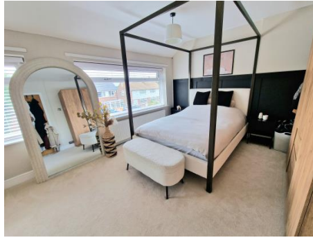
MASTER BEDROOM 16' 5" x 11' 6" (5.00m x 3.50m)