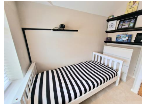
BEDROOM FOUR 9' 2" x 7' 0" (2.79m x 2.13m)