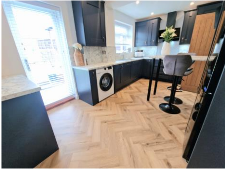
FITTED KITCHEN 15' 9" x 9' 10" (4.80m x 2.99m)