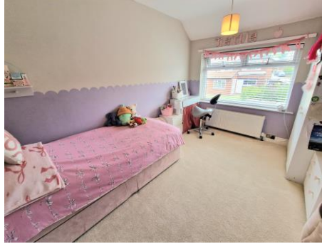
BEDROOM TWO 12' 0" x 9' 3" (3.65m x 2.82m)