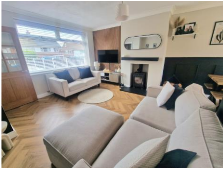
THOUGH LIVING / DINING ROOM 23' 3" x 13' 0" (7.08m x 3.96m)