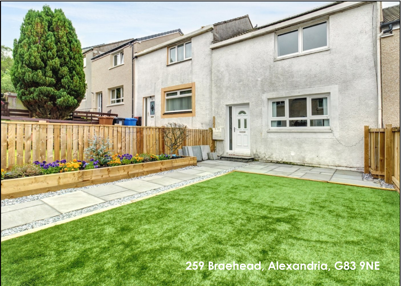
259 Braehead, Alexandria, G83 9NE

David Muir Estate Agents are delighted to present this attractive two-bedroom mid-terrace villa, ideally positioned within a popular residential area close to shops, transport links, and well-regarded schooling.