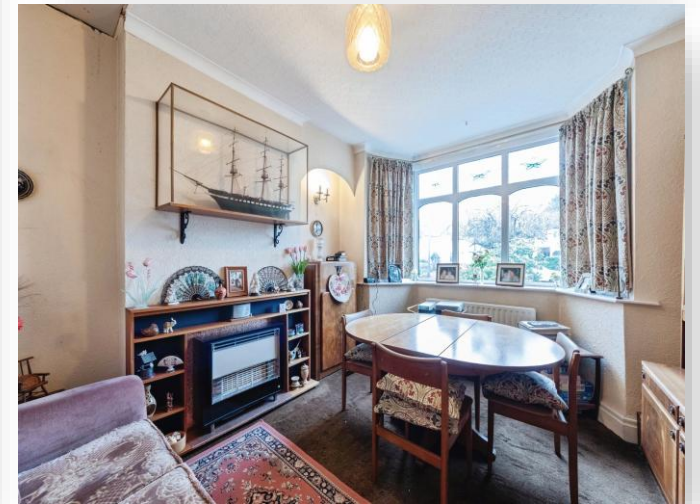
Colebrook Croft, Shirley Solihull B90 2JD