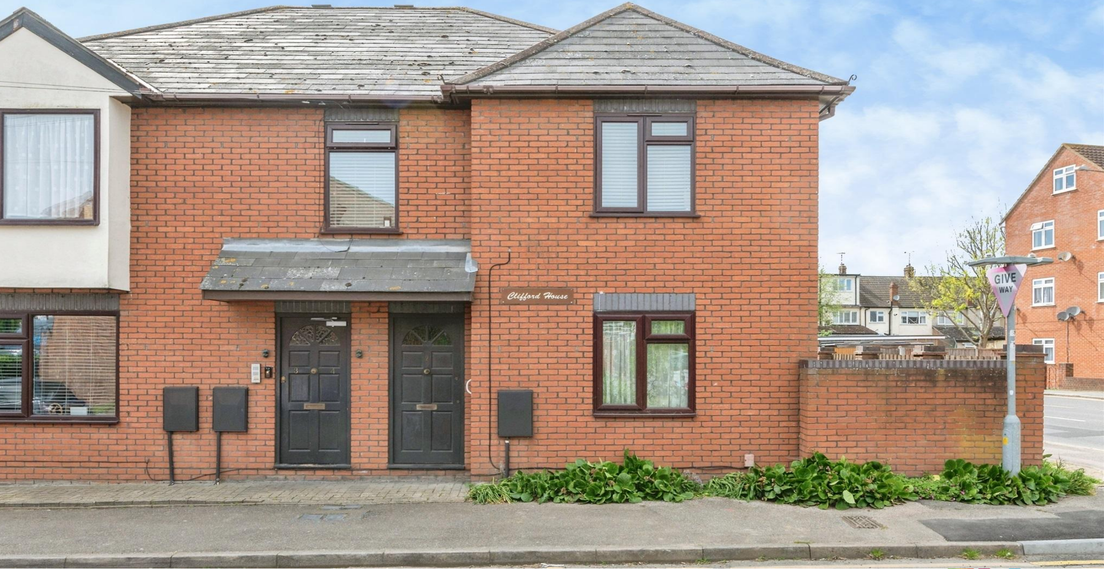
Clifford House, Runnymede Road, Stanford-Le-Hope SS17 0JY