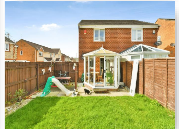
Bridle Close, Plymouth PL7 5LF