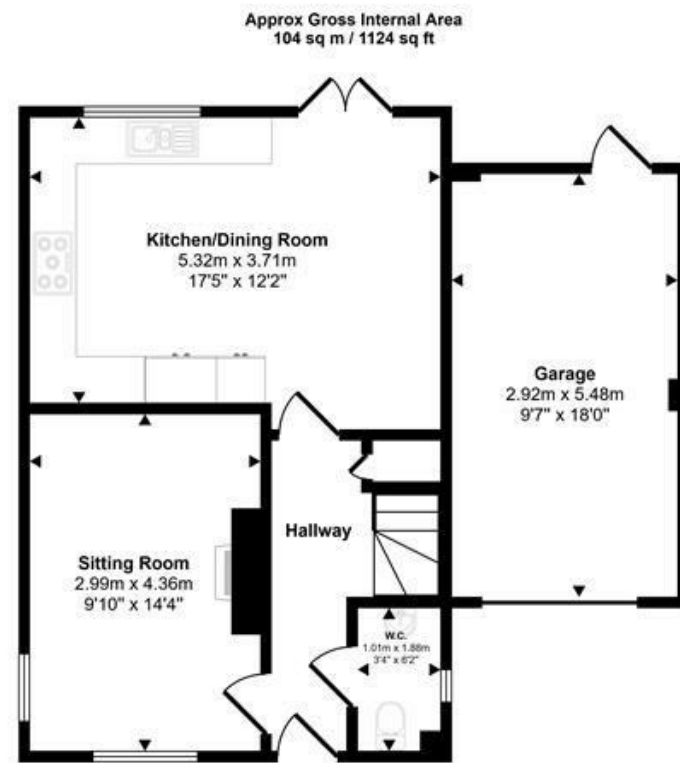
Ground Floor Approx 60 sq m / 650 sq ft