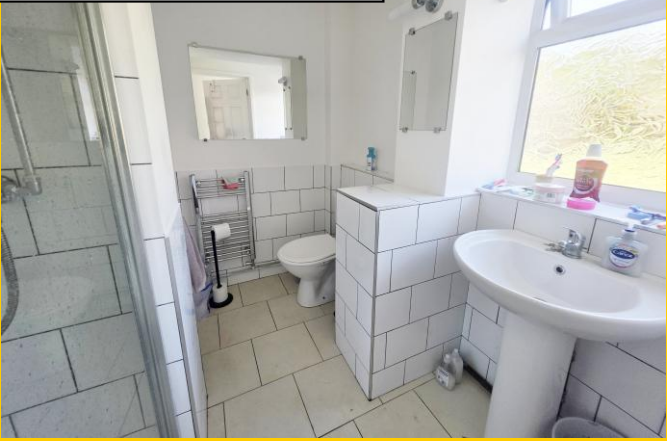
GF Shower Room