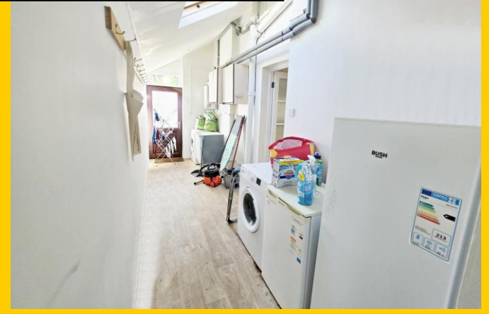
Entryway / Utility