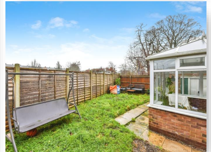
Le Marchant Close, Devizes SN10 2EZ