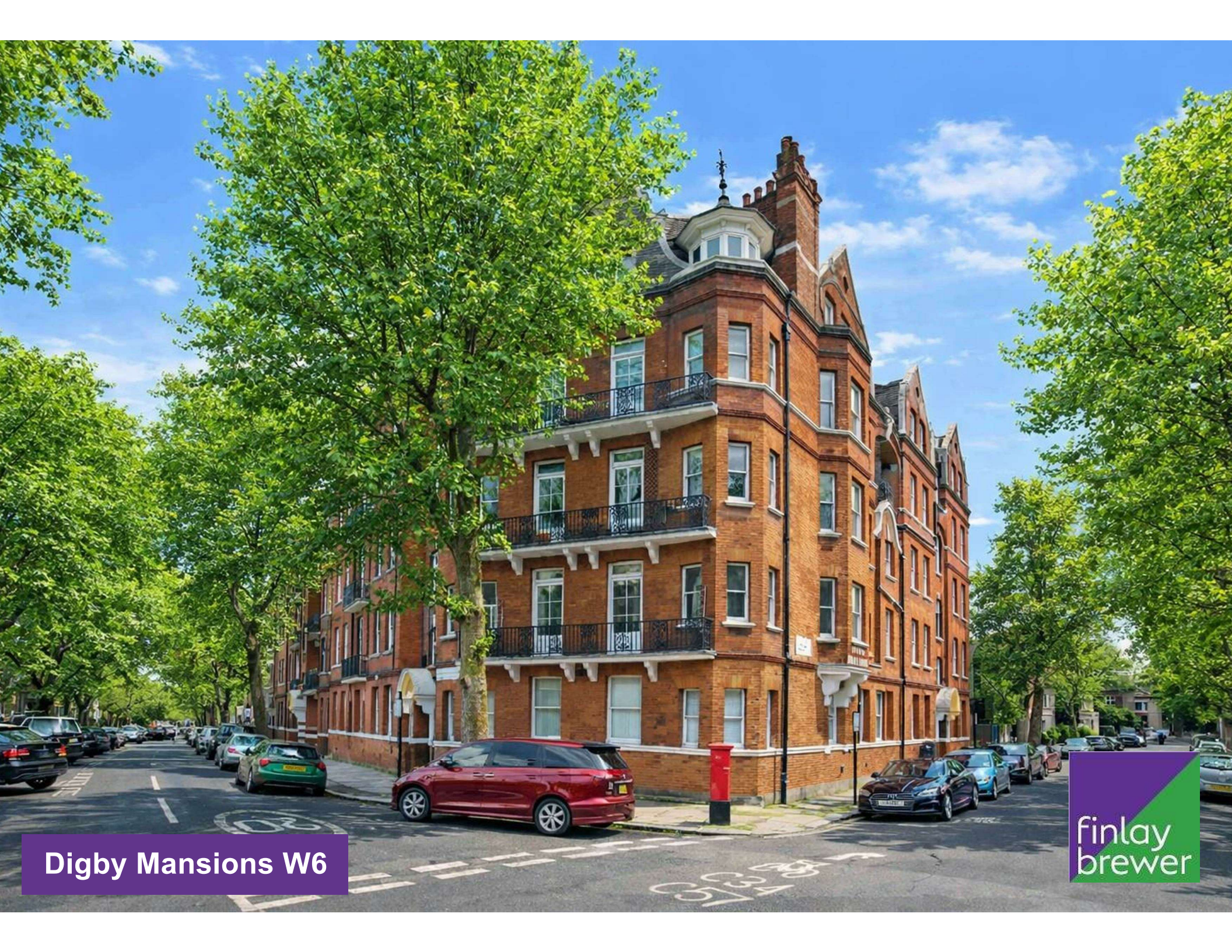
Digby Mansions W6