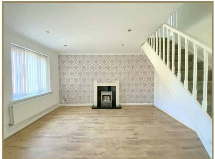
2 Deene Close, Grimsby, North East Lincolnshire, DN34 5XB £155,000