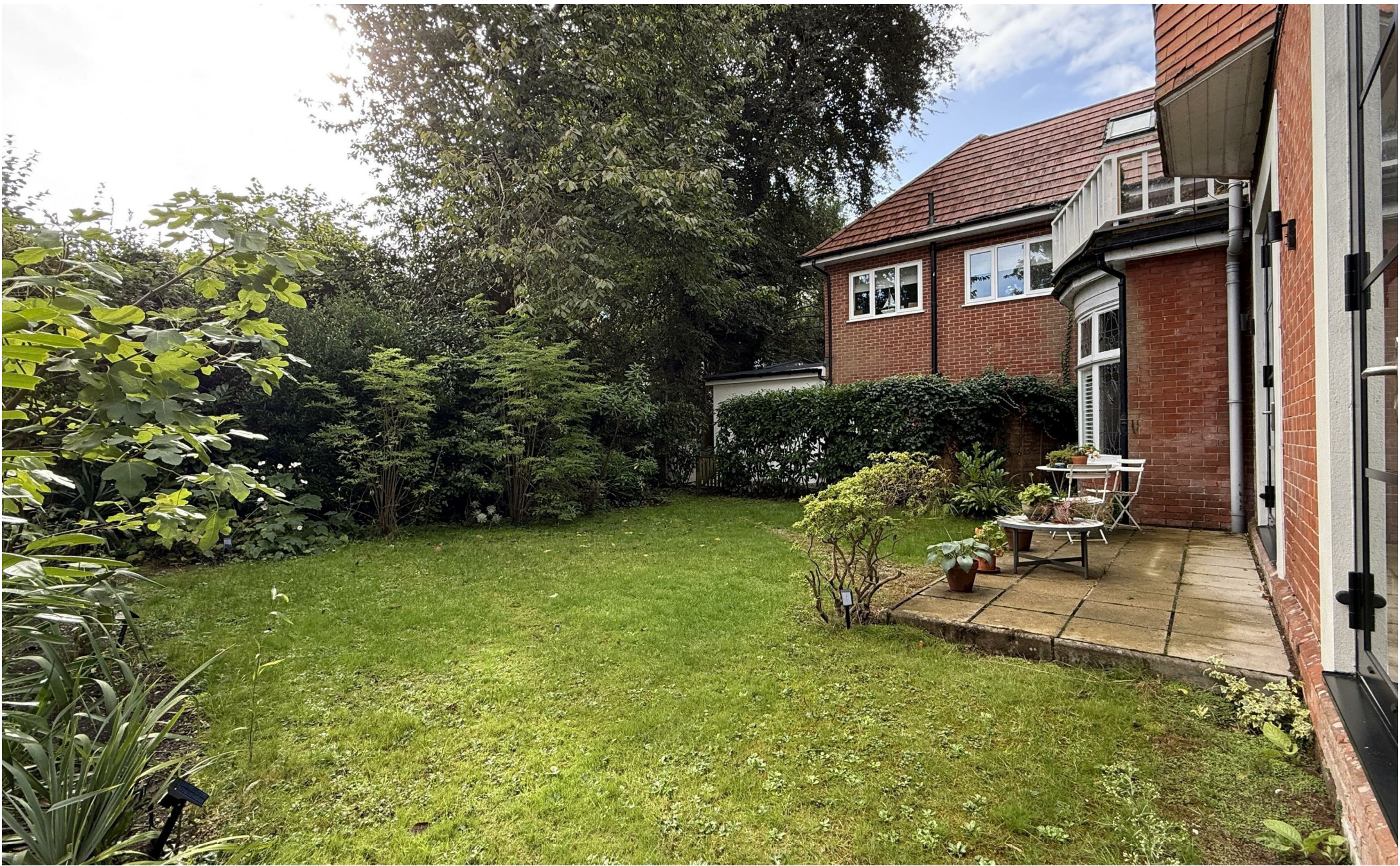
Flat 2 Pinehurst Hall 23 Burton Road, Poole BH13 6DT Guide Price £525,000 Share of Freehold