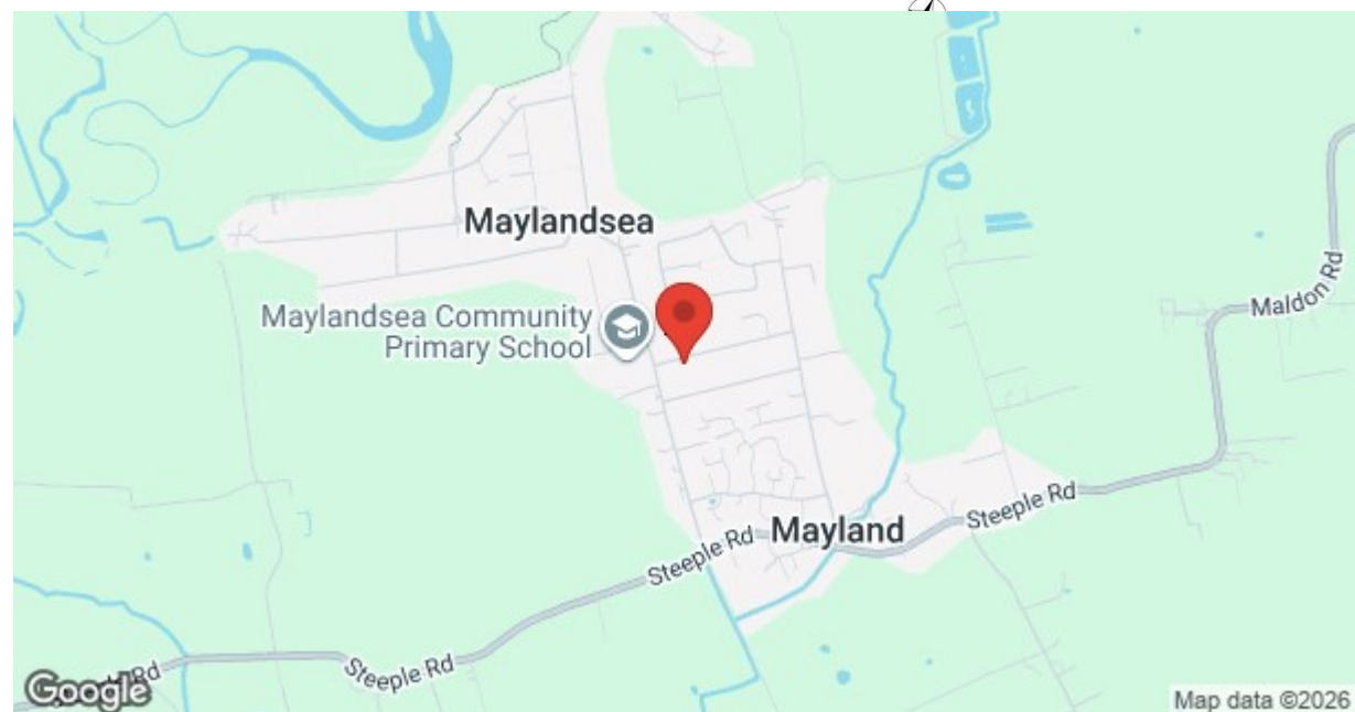
Wembley Avenue Mayland, Chelmsford, CM3 6AY Approximate Gross Internal Area = 123 sq m / 1323 sq ft