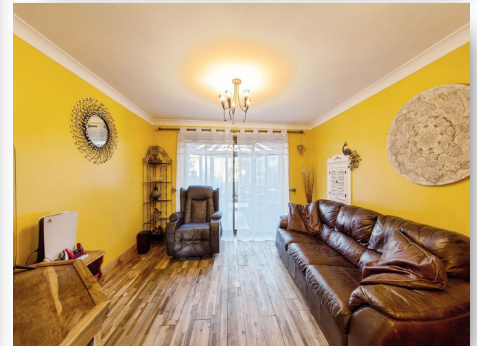
North Fen Road, Helpringham Sleaford NG34 0RR