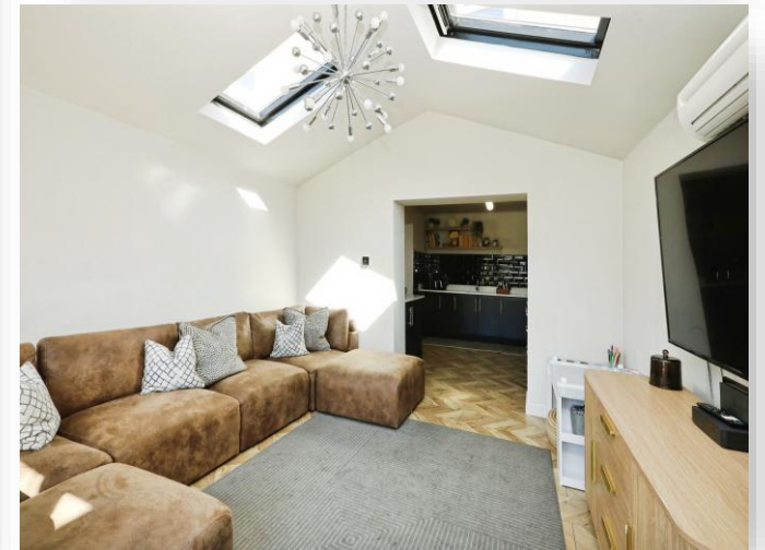
Denaby Avenue, Conisbrough Doncaster DN12 3NL