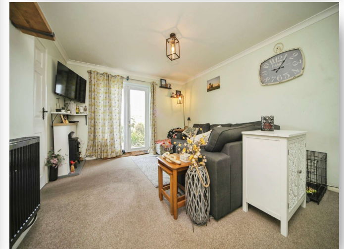
Birch Avenue, Bacton STOWMARKET IP14 4NT