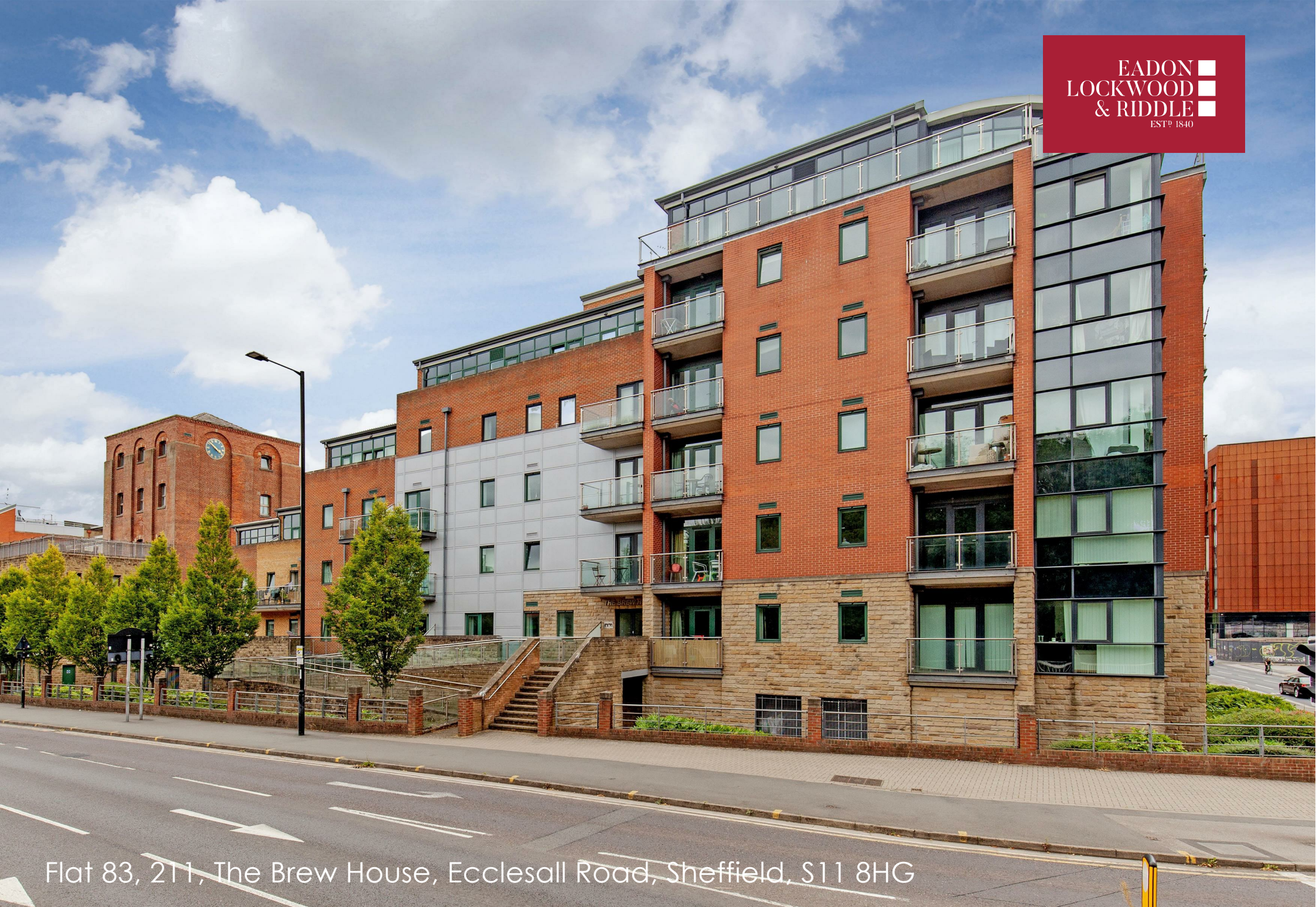
Flat 83, 211, The Brew House, Ecclesall Road, Sheffield, S11 8HG