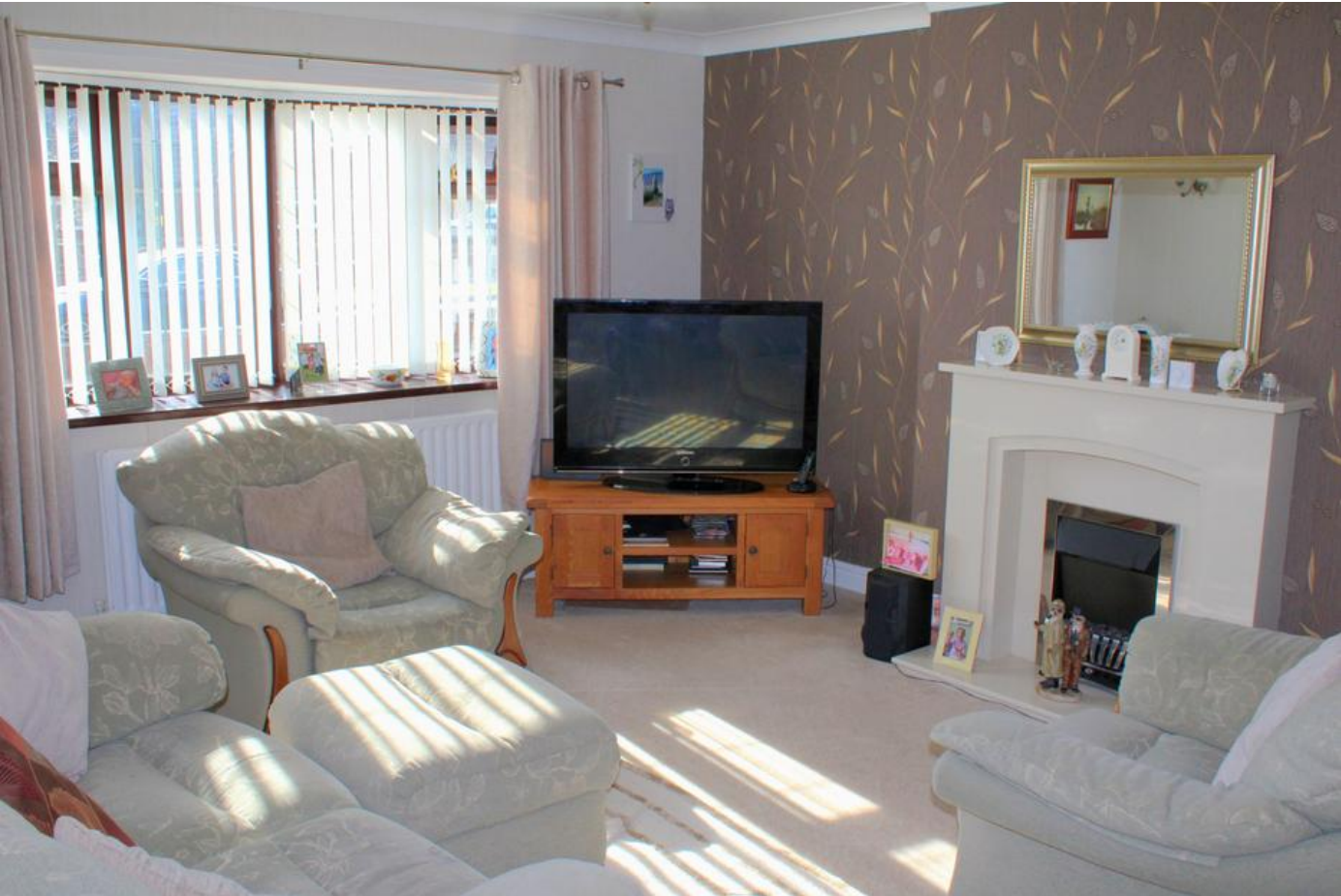
LOUNGE 4.72m x 4.23m (15'6" x 13'11")