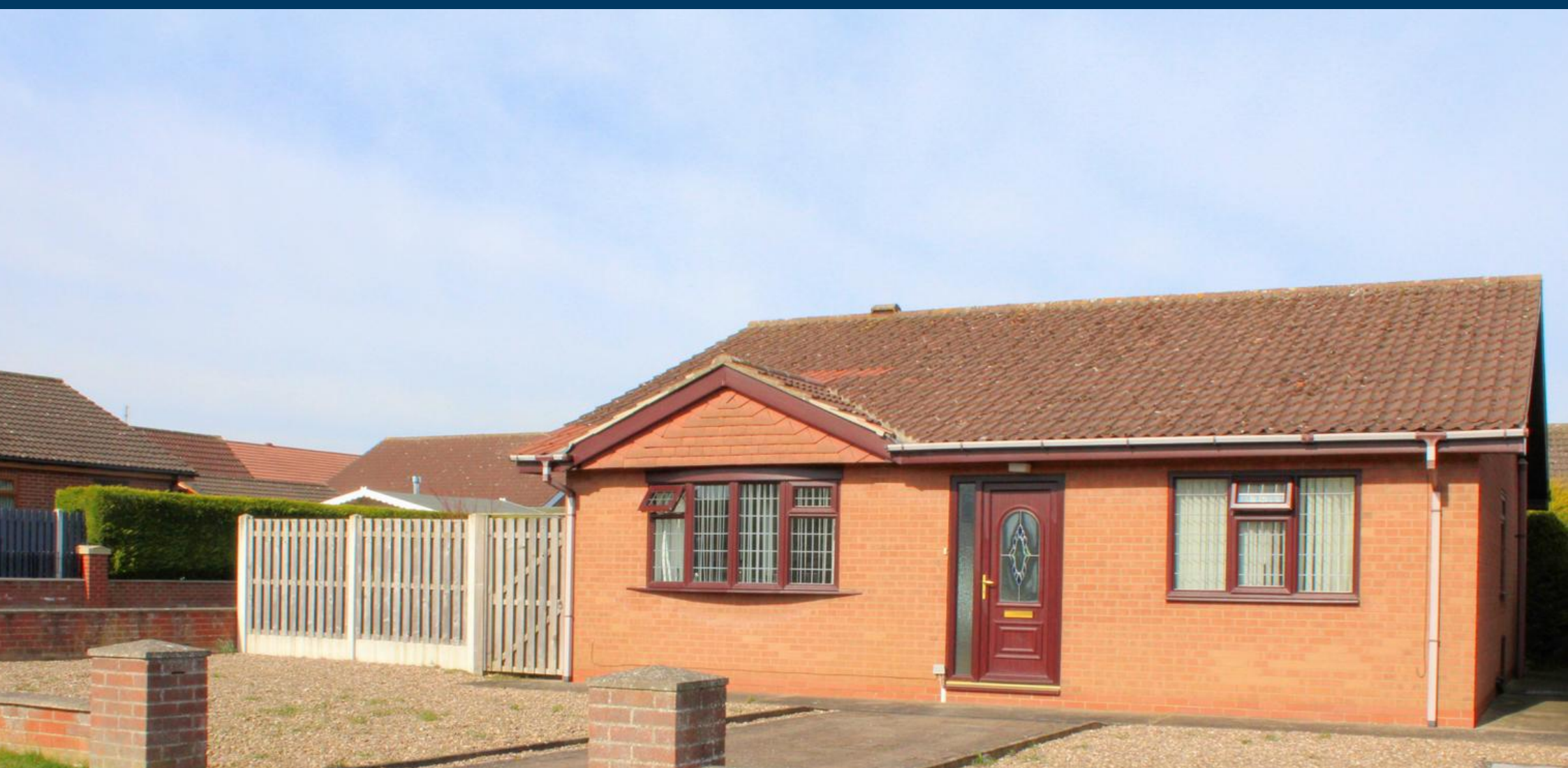
Woods Meadow, Hibaldstow