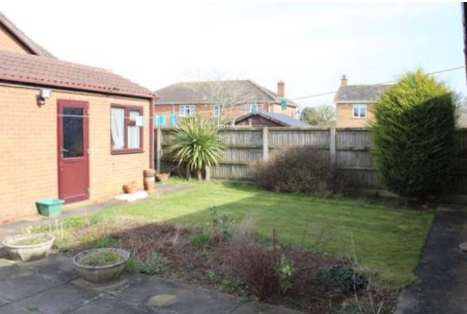
windows to the side and a further matching window to the

glazed window. A 2 car side reception drive completes the home.