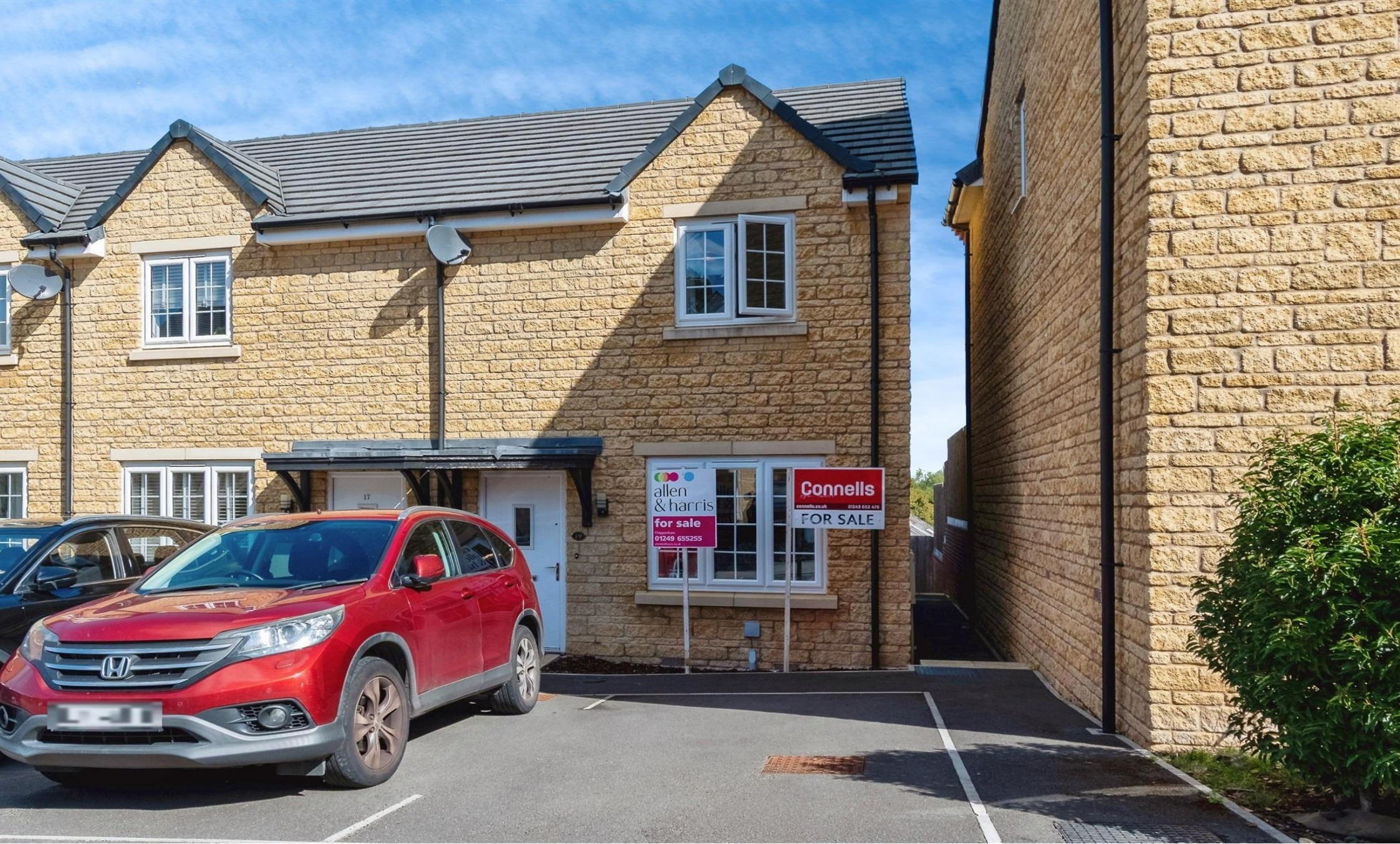
Wheatfield Avenue, Chippenham SN14 0FX