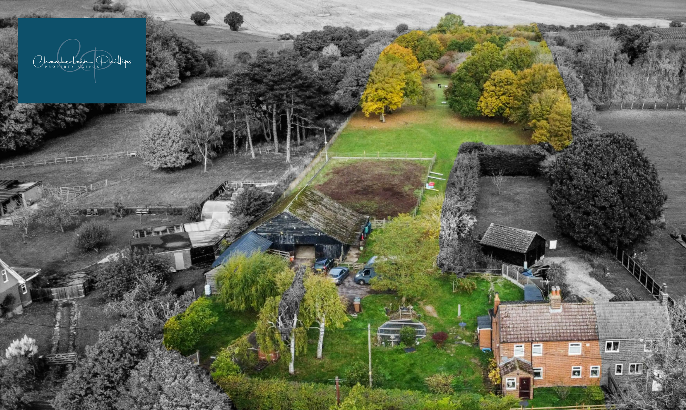
Tye Lane, Bramford Guide Price £550,000