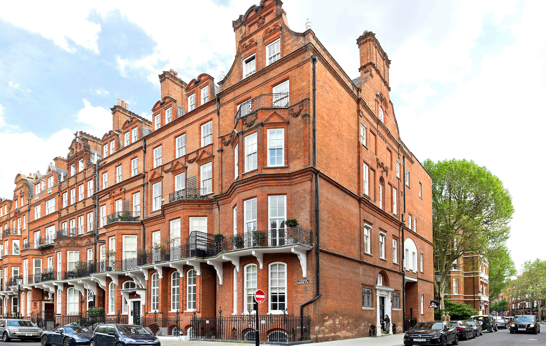
Cadogan Square, SW1