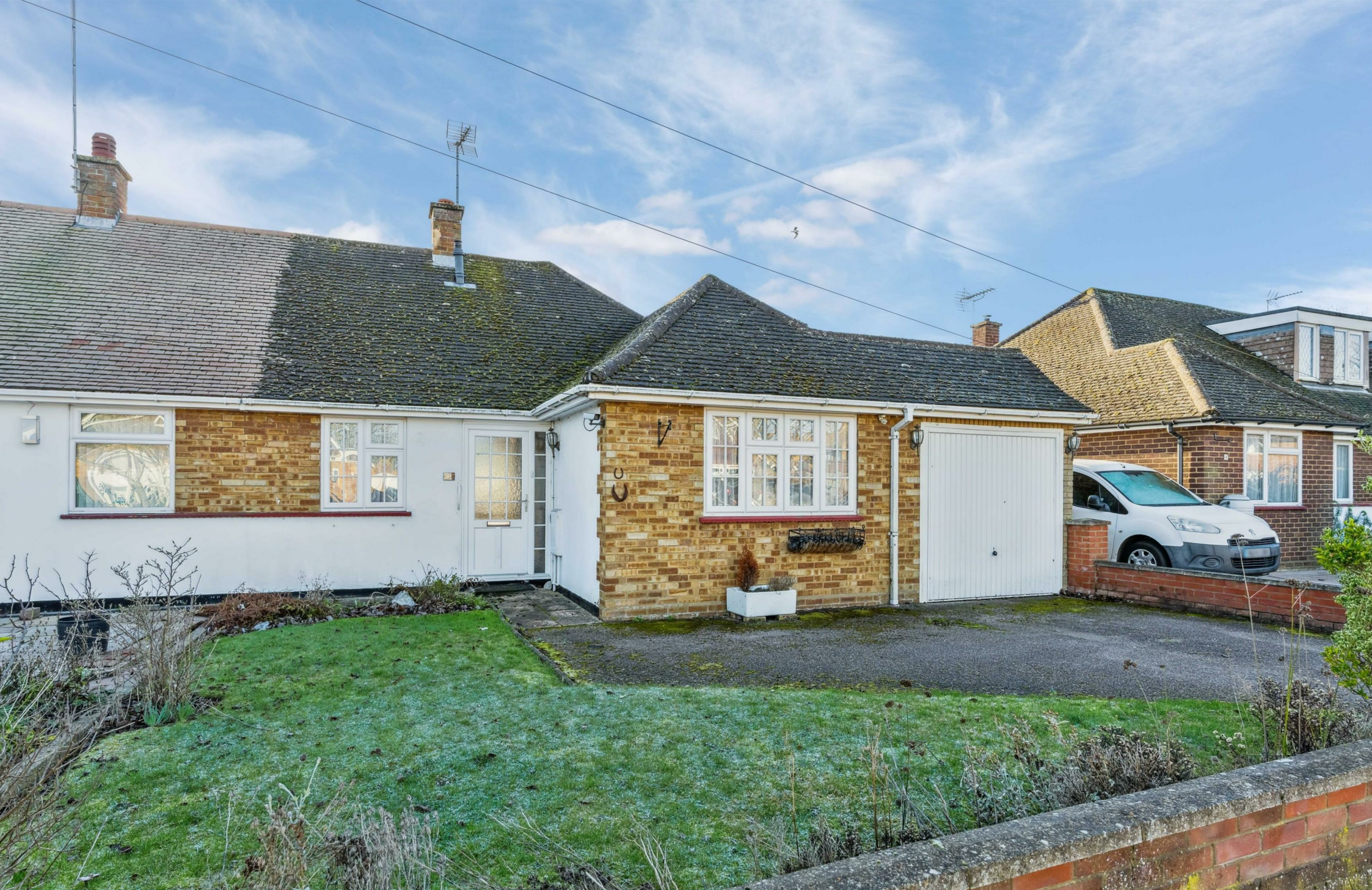
Priory View, Hitchin