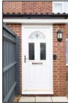
Front Door and Entrance Porch