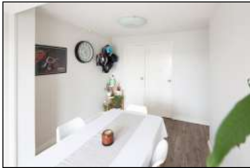
Extended Dining Room