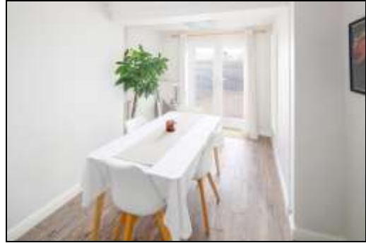
Extended Dining Room