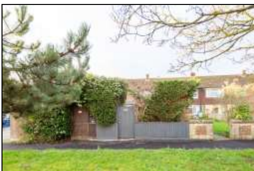
View to Front