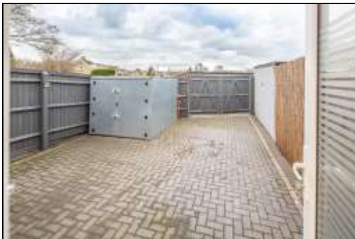
10ft Wide Vehicle Access and Bike Store