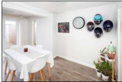
Extended Dining Room