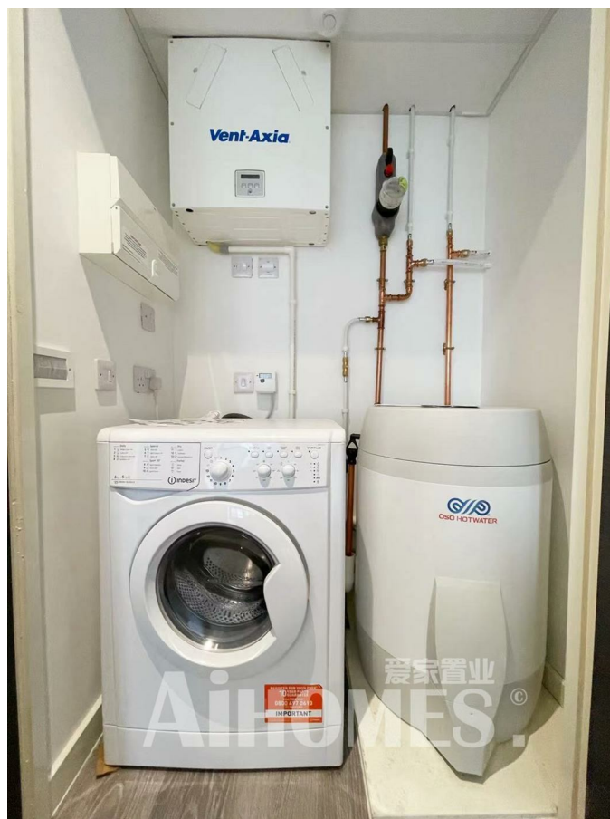
F186150DT, 7 Woden Street, Salford