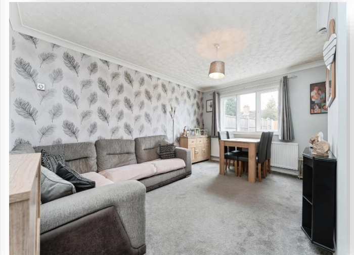
Edmund Road, Brandon, IP27 0XA