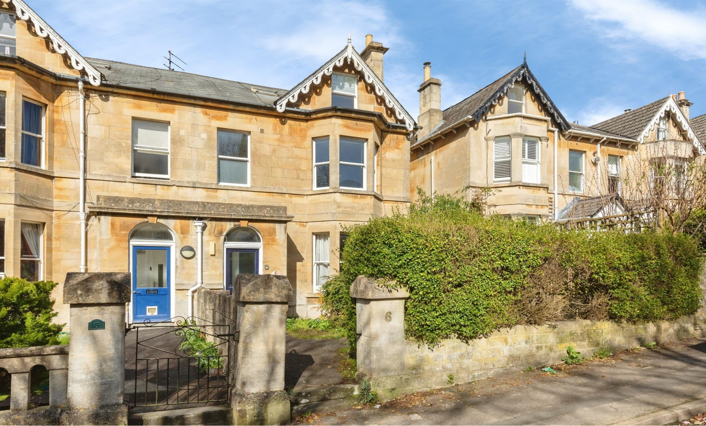
Flat 2 St. Lukes Road, Bath BA2 2BB