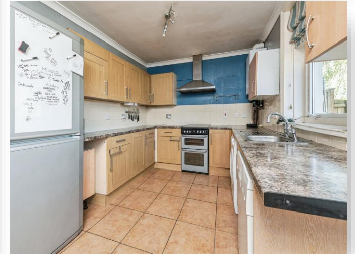
Larch Avenue, Thongsbridge HOLMFIRTH HD9 7SR