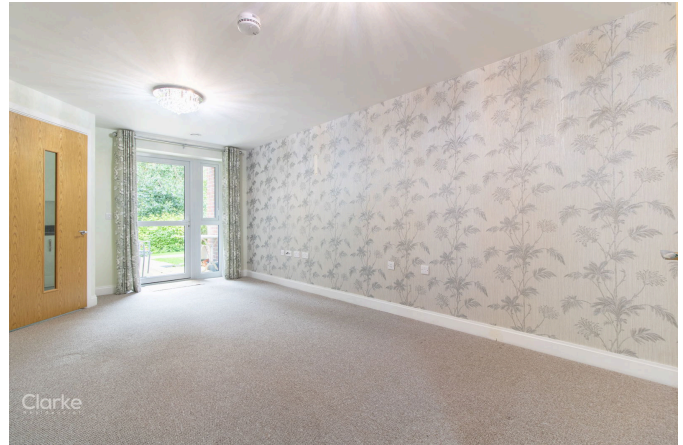
Haworth Court, Preston Road, Chorley Approximate Gross Internal Area 866 Sq Ft/80 Sq M