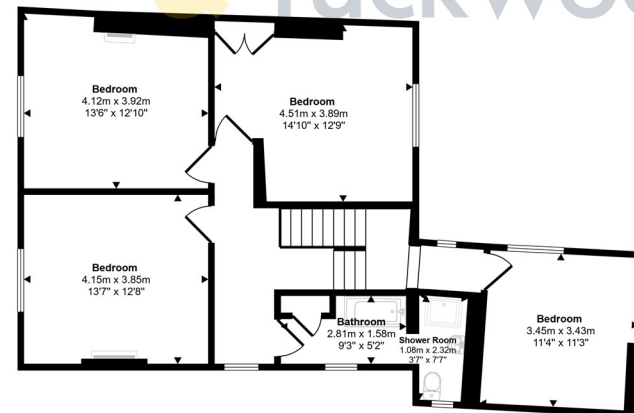
First Floor Approx 84 sq m / 908 sq ft

This floorplan is only for illustrative purposes and is not to scale. Measurements of rooms, doors, windows, and any items are approximate and no responsibility is taken for any error, omission or mis-statement. Icons of items such as bathroom suites are representations only and may not look like the real items. Made with Made Snappy 360.