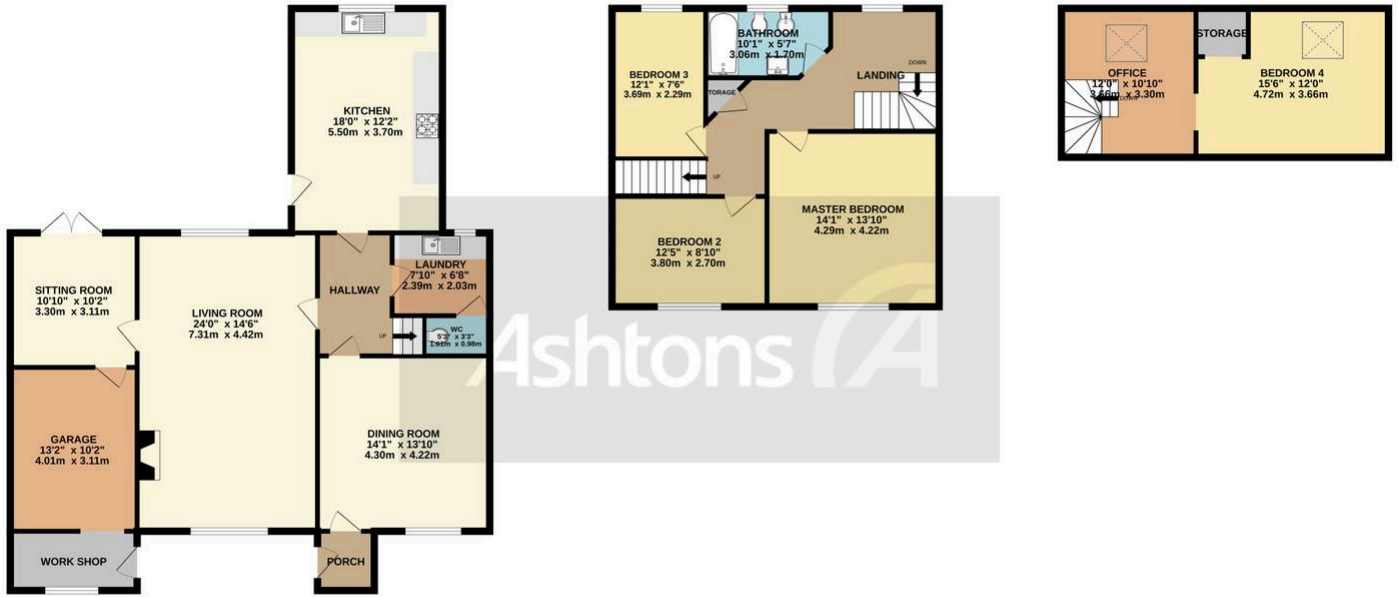
2ND FLOOR 315 sq.ft. (29.3 sq.m.) approx.

TOTAL FLOOR AREA : 2154 sq.ft. (200.1 sq.m.) approx.