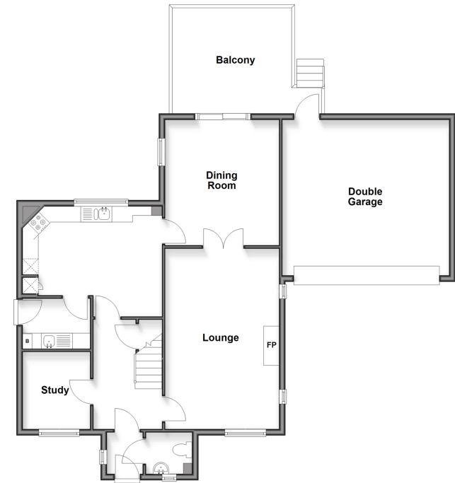
First Floor Approx. 69.5 sq. metres (748.3 sq. feet)