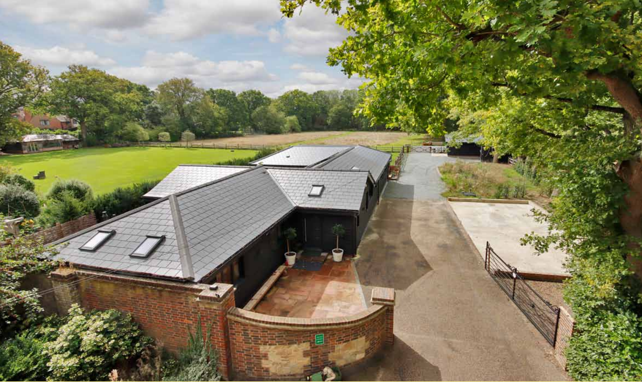
The Hollies, How Green Lane, Hever, Kent TN8 7NN Guide: £1,250,000 Freehold