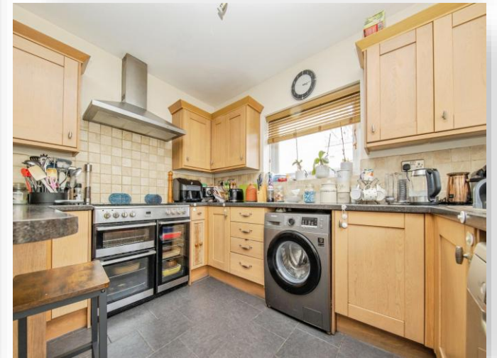
Mayes Lane, Ramsey HARWICH CO12 5EJ