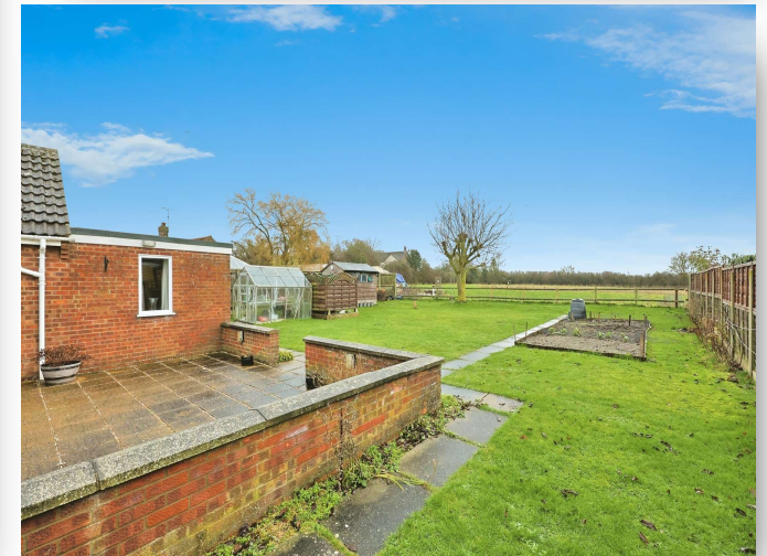
Iceni, Litcham Road, Mileham, PE32 2PS